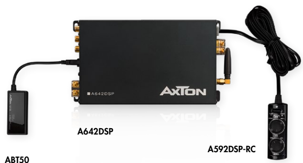
Optional Hi-Res audio streaming interface ABT50 and optional remote control for A642DSP with 4 m cable, setting of bass level, volume level and muting.