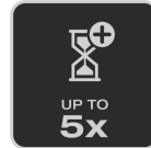
Up to 5 times longer lifetime3)

See and be seen with OSRAM. Cool white color temperature similar to daylight. For more safety on the road, especially when driving at night