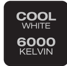
6000K & Cool White

The NIGHT BREAKER LED family - OSRAM's first street-legal1) LED retrofit lamps.