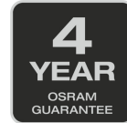
4 year OSRAM guarantee

Vibration resistant, environmentally friendly, and cost-efficient